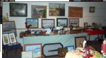
Folk Art Artisan Sale ↓