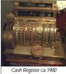
Cash Register ca. 1900

The attached audited Financial Statements for the year ended December 31, 2005 show that, unlike 2004, we now face an overall deficit for the year. Although our membership retention was down $2,287, or about 13%, donations remained almost the same as a year before; a slight increase of $101.