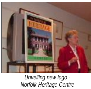
Unveiling new logo - Norfolk Heritage Centre