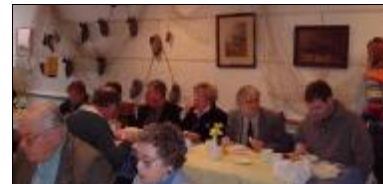
← 2005 Volunteer Appreciation Luncheon ↓