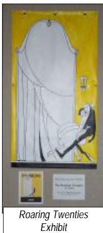
Roaring Twenties Exhibit