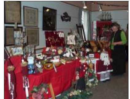
Local Artisans displayed and sold their work During the opening of "Finding Folkart" Exhibit.