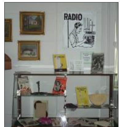
Roaring Twenties Exhibit