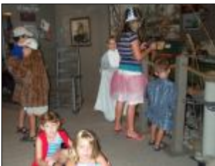
2005 Heritage Adventures

"Heritage Adventures", our summer hands-on history for children. Youngsters aged five to eleven spent July and August mornings in hands-on history of all sorts, giving experience to a half-dozen enthusiastic young adolescent volunteers